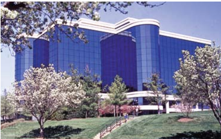
Mack-Cali's award-winning property management team provides responsive, professional attention to the needs of tenants. (Pictured above: 6406 Ivy Lane.)

Don't miss out on this unique opportunity for a custom-built facility for your business.