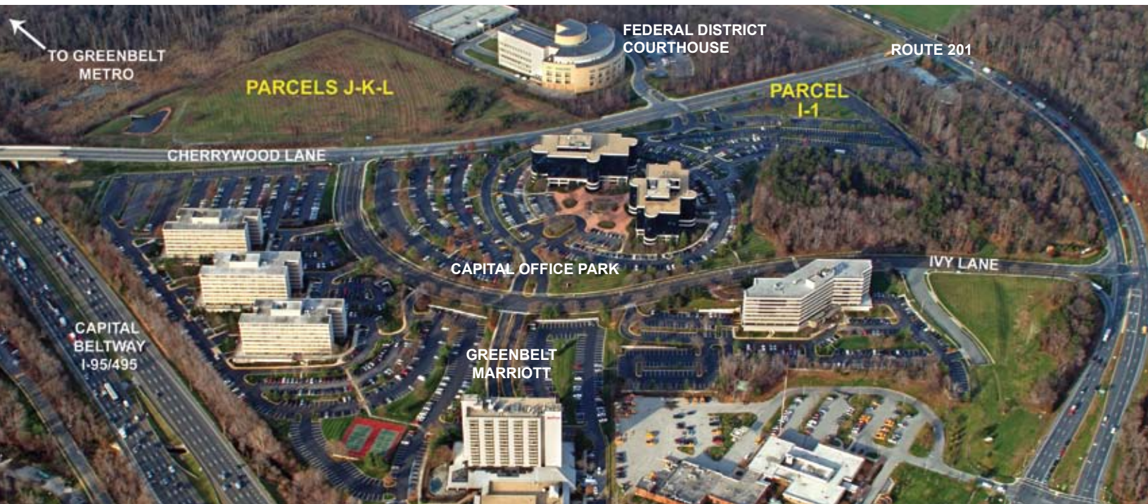
Capital Office Park offers an exceptional Beltway location that's ideal for a custom-built office facility.

Capital Office Park • Greenbelt, Maryland